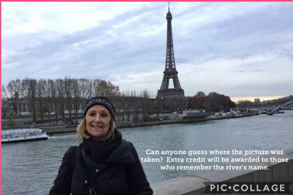
Can anyone guess where the picture was taken? Extra credit will be awarded to those who remember the river's name.