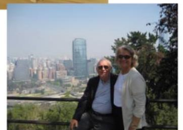
Travel 2018 ! Interesting places and people. Exciting and fun year!