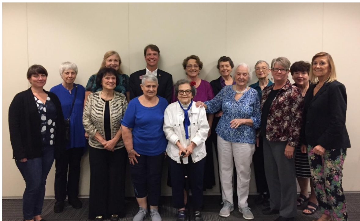
BETA SIGMA MEMBERS WITH REPRESENTATIVE SPENCER FRYE